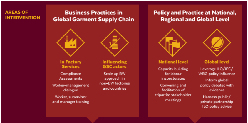
Figure 1: Better Work areas of intervention

There is a relatively high number of stakeholders in the Better Work Global programme. In order to have an overview and a better understanding they have been mapped along two dimensions, i.e. by distinguishing between stakeholders at global and national level on the one hand and between stakeholders in the private and public sector on the other hand. The two dimensions are derived from the BW areas of interventions (Figure 1). The intervention area "Business Practices in Global Garment Supply Chain" is focussing on the private sector, both at national and global level. The intervention area "Policy and Practice at National, Regional and Global Level" is addressing the public domain at the national and global level.