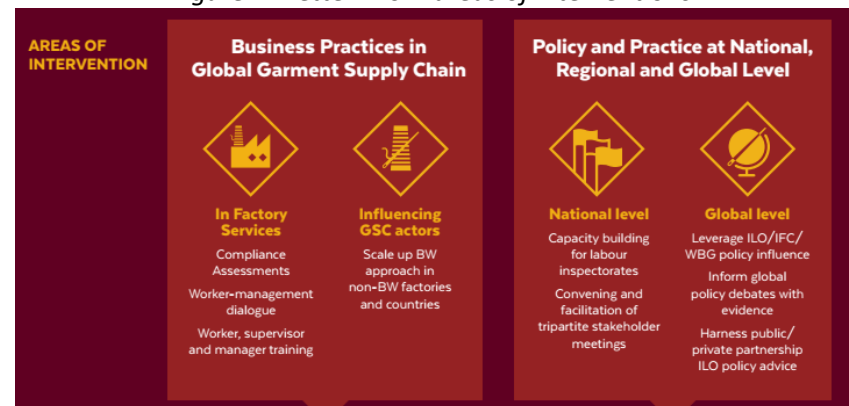
Figure 1: Better Work areas of interventions

Activities under intervention area 2 can impact public institutions and policies beyond the garment sector and beyond those countries where Better Work has established programmes.